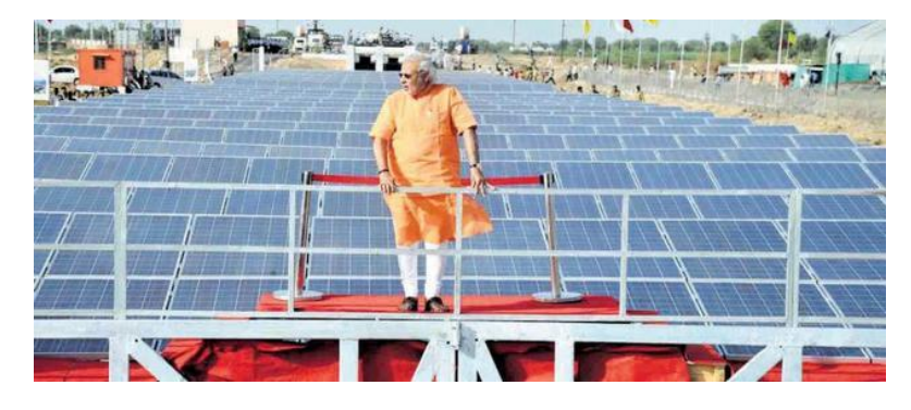
Shining bright: The Gujarat Chief Minister, Mr Narendra Modi, stands in front of a solar panel during the dedication and inaugration of India's first 1MW canal-top solar power plant at Chandrasan village, 45 km from Ahmedabad.

MEHSANA (GUJARAT), APR 25: If even 10 per cent of the 19,000 km-long Narmada canal network in Gujarat is used for setting up canal-top solar panels, it has the potential to produce 2,200 MW of solar power, save 11,000 acres of land that would otherwise be used and prevent 2,000 crore of precious water from evaporation annually, the Chief Minister, Mr Narendra Modi, said.