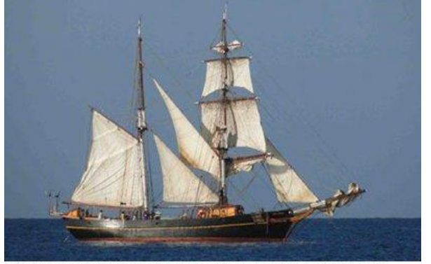
The 32-metre brigantine Tres Hombres maintains a sustainable freight service between Europe, the Atlantic islands, the Caribbean and America.

This article titled "UK's only carbon-neutral chocolate arrives by sailing ship" was written by John Vidal, for guardian.co.uk on Friday 11th May 2012 11.29 UTC