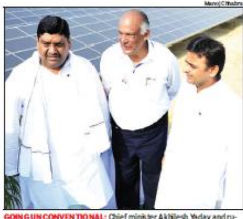
GOIN GUN CONVENTIONAL: Chief minister Akhitesh Yadav and rural development minister Arvind Singh Gope during the inauguration of 2 MW solar power plant in Barabanki on Thursday

According to sources in UP Power Corporation Limited, in most cases, the production cost at a solar plant ranges around Rs 12 per unit, while the corporation purchases power at the rate of around Rs5 per unit. "The