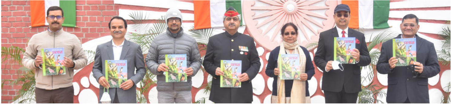
2nd edition of the Annual Hindi magazine of IIML Palash was launched on 26 January 2022